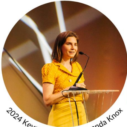
2024 Keynote Speaker Amanda Knox